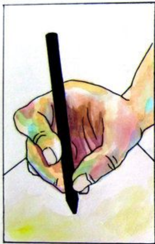
THE RIGHT WAY